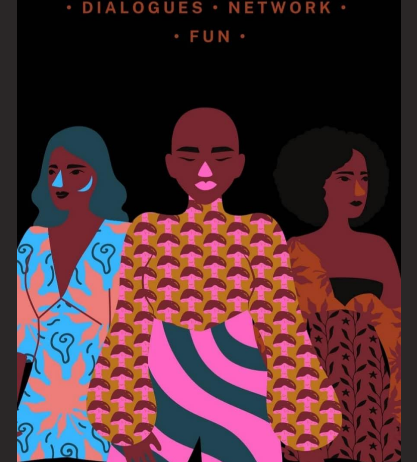
Towunmi Coker Literary Initiative, Lagos, Nigeria