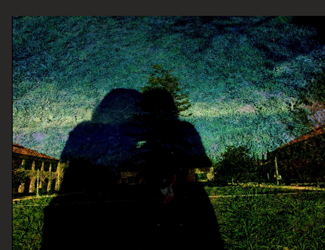
Outside the Lens, San Diego CA, USA