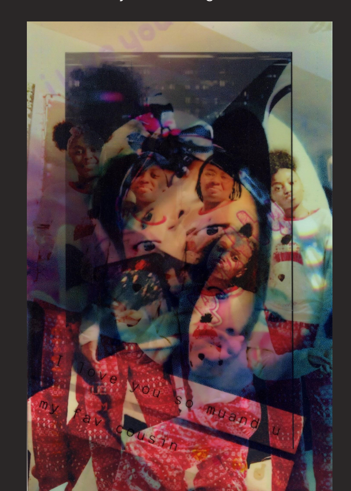
Snow City Arts, Chicago IL, USA