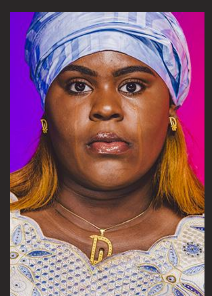
NYCSalt Inc. New York City NY, USA