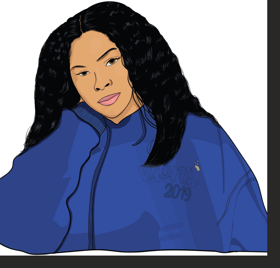
South Street Center, Boston MA, USA